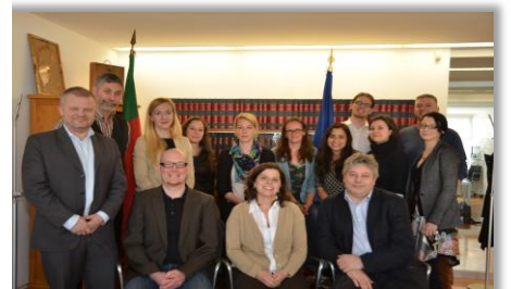
[Participants of the working group meeting, Lisbon, 2014]

Several meetings and seminars were held this year. These events significantly helped to improve the overall quality of the project. In March 2014, the consortium met in Lisbon with external experts for a two-day working group meeting on the reporting structure and focus of analysis for the fifth round of EUROSTUDENT. Two months later, the members of the EUROSTUDENT Consortium came together in Malta for a seminar on intelligence briefs and further initiatives to support the exploitation of the EUROSTUDENT data set.