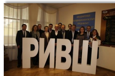
[EUROSTUDENT NIS-Initiative participants, Minsk, 2014]

As previously reported, it has been an important goal of the fifth round of EUROSTUDENT to reach out to countries, which had not previously participated in the project. A special focus was set on the Newly Independent States. A final preparatory meeting was held in Minsk on the 14 February 2014 with the participation of representatives from Armenia, Belarus, Georgia, Kazakhstan, Russia and the Ukraine. This initiative has led to the countries Armenia, Georgia, Russia and the Ukraine providing carrying out student surveys and providing their data for the EUROSTUDENT data set.