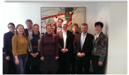
[Members of the the Steering Board, Berlin, 2014]

Further, the EUROSTUDENT Consortium met in Tallinn in October to discuss the third quality check report, the concept of the Data Reporting Module (DRM), and strategies for supporting national exploitation initiatives. Taken together, these events significantly contributed to improving the data delivery, data analysis and data exploitation. All issues which were highlighted as important by the International Steering Board at its meeting in April 2014.