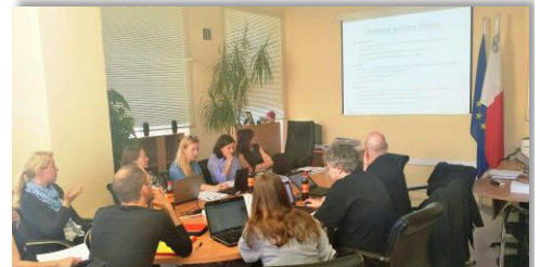
[Members of the the Consortium, Malta, 2014]