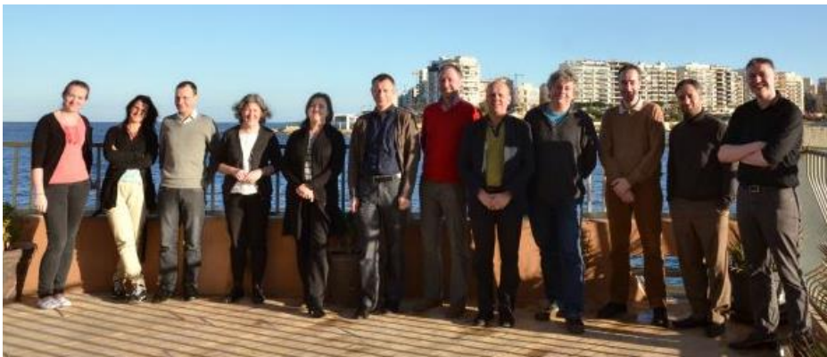
[Second preparatory seminar in Malta, 13-16 January 2013]