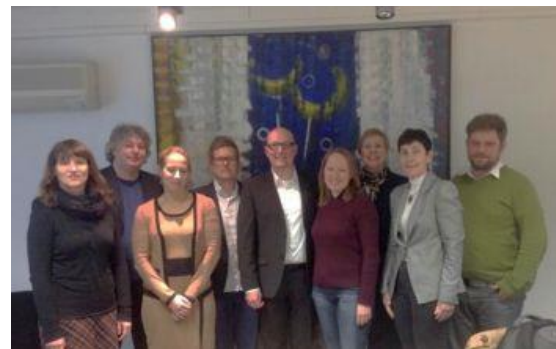
[Members of the Steering Board, German Federal Ministry of Education and Research, Berlin]