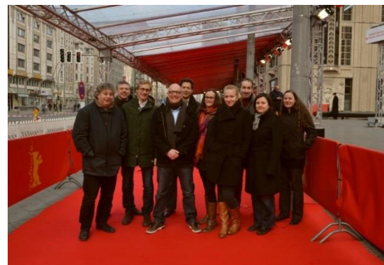
[Consortium members (briefly) on the Berlinale red carpet]