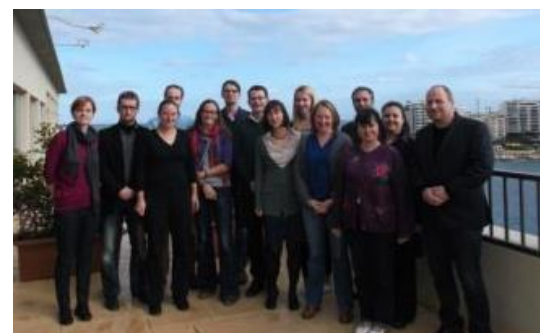
[First preparatory seminar in Malta, 10-13 December 2012]

In accordance with the workplan of EUROSTUDENT V project, the Consortium organized three preparatory seminars to support the participating countries on executing the EUROSTUDENT survey in national settings. Given that these preparatory seminars were the sole opportunity for participating countries to meet and discuss the implementation of their national surveys with the EUROSTUDENT V Consortium during the entire project period, the agenda of the seminar covered a wide spectrum of issues.