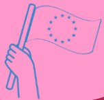
Commissioner Mariya Gabriel

The European strategy for universities and the proposal for a Council recommendation on transnational cooperation “ will benefit the entire higher education sector, first and foremost our students . They need modern transnational campuses with easy access to mobility abroad to allow for a truly European study path and experience. We stand ready to join forces with the Member States and higher education institutions across Europe. Together we can bring closer education, research and innovation in service to society. ”